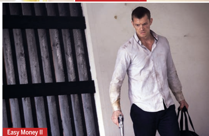
Easy Money II

Feature docs continue to have traction in the market. Svensk is holding closed market screenings of new feature doc Liv & Ingmar . Backed by the Norwegian Film Institute, Dheeraj Akolkar's