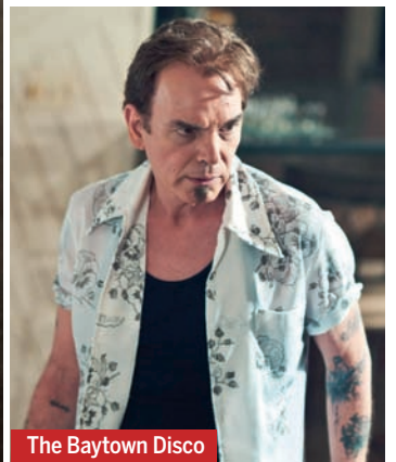
The Baytown Disco