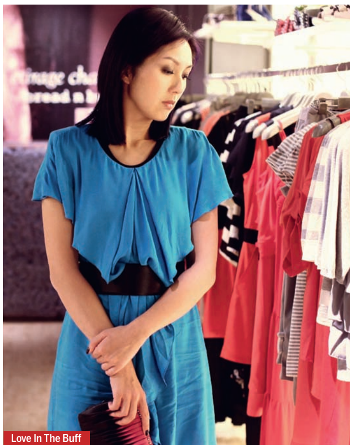
Love In The Buff