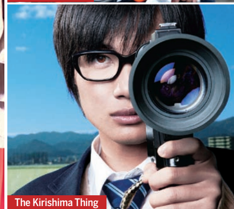
The Kirishima Thing