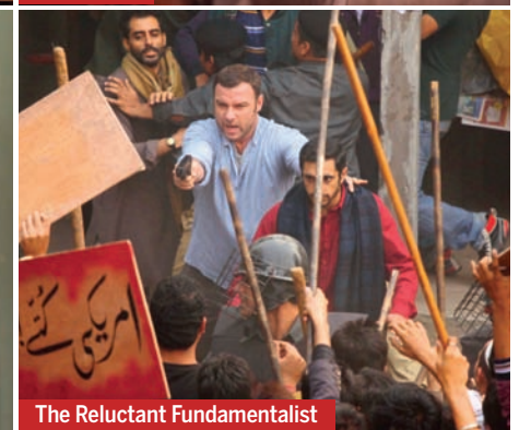
The Reluctant Fundamentalist

Kristin Scott Thomas; extended footage of Neil Jordan thriller Byzantium ; and a promo of Gabriele Salvatores' Siberian Education . Israeli thriller Bethlehem is in post.