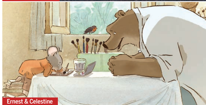
Ernest & Celestine