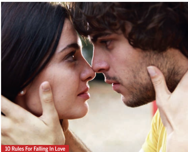
10 Rules For Falling In Love