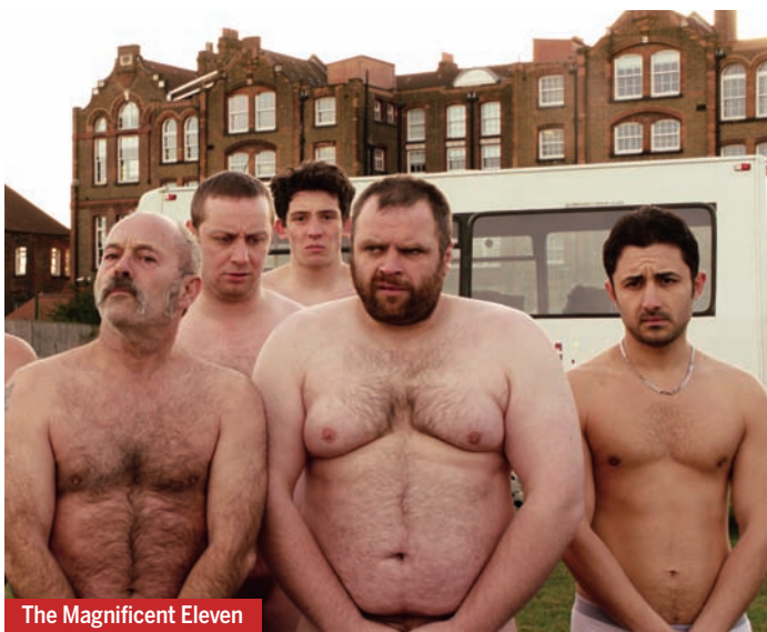
The Magnificent Eleven