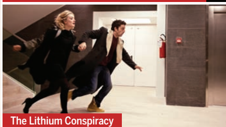
The Lithium Conspiracy