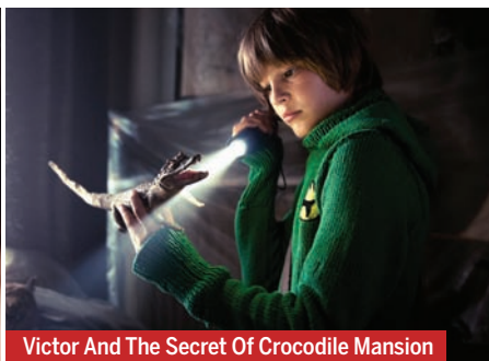
Victor And The Secret Of Crocodile Mansion