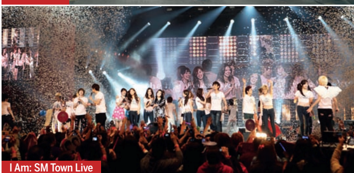
I Am: SM Town Live

M-Line Distribution is screening sci-fi drama Doomsday Book , co-directed by Kim Jee-woon and Yim Pil-sung, and romantic comedy All About My Wife , as well as introducing El Condor Pasa , directed by Jeon Soo-il ( With A Girl Of Black Soil ).