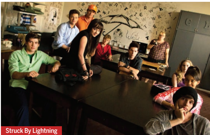
Struck By Lightning